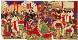
Title: Distinguished Officers Receiving Sake from the Emperor for Putting Down the Satsuma Rebellion Date: 1877 Primary Maker: Yōshū Chikanobu Medium: color woodblock print on paper