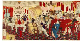
Title: The Prefect of Police and His Men Take Food and Drink with Officers of the Military Forces During the Satsuma Rebellion Date: 1877 Primary Maker: Tsukioka Yoshitoshi Medium: color woodblock print on paper