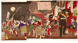
Title: Account of the Subjugation of Kagoshima: Scene from the Satsuma Rebellion depicting Rebel Leader Saigo Takamori and Young Recruits at an Encampment, with Some Youths crying After a Military Setback Date: 1877 Primary Maker: Tsukioka Yoshitoshi Medium: color woodblock print on paper