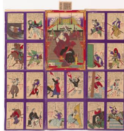
Title: Satsuma Rebellion Picture Sugoroku Game Board Date: 1877 Primary Maker: Tsukioka Yoshitoshi Medium: Polychrome woodblock print on six sheets of paper, joined with wheat paste