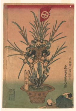
Title: Untitled (The Satsuma Rebellion) Date: 1877 Primary Maker: Yoshitora Utagawa Medium: color print