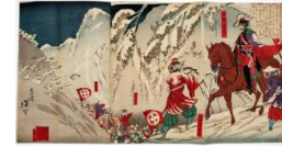
Title: Snow, moon, and flowers in the Seinan [Satsuma Rebellion] War: Going into Battle at Kawajiri in the Snow (Seinan setsugekka uchi, Kawajiri shutsujin no yuki) Date: 1877 Primary Maker: Tsukioka Yoshitoshi Medium: color woodblock print on paper