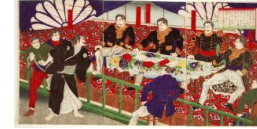
Title: The Arraignment of Oyama Tsunayoshi in the Satsuma Rebellion Date: 1877 Primary Maker: Yōshū Chikanobu Medium: color woodblock print on paper