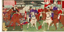
Title: The Meiji Government Brings Steamships Against Satsuma Rebels Date: 1877 Primary Maker: Yōshū Chikanobu Medium: color woodblock print on paper