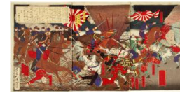
Title: A Clash Between Meiji and Rebel Forces During the Satsuma Rebellion Date: 1877 Primary Maker: Tsukioka Yoshitoshi Medium: color woodblock print on paper