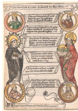
Title: Frontispiece to the Book Der Seusse Date: 1492 Primary Maker: Unidentified artist Medium: Woodcut