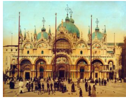
Title: Piazza San Marco Date: c. 1900 Primary Maker: Unidentified artist Medium: gelatin silver print with hand-coloring