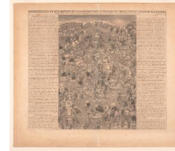
Title: Representation and Description of the Rebellion of the Four Mogul Princes against the Emperor their Father, and of the Battle where Aurengzebe Conquered his three Brothers and afterwards had Himself Proclaimed Emperor Date: 18th century Primary Maker: Unidentified artist Medium: etching and engraving