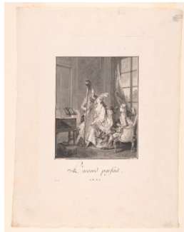
Title: Perfect Harmony (L'accord parfait) plate 20 from Le monument du costume, 2nd series Date: 1777 Primary Maker: Unidentified artist Medium: etching and engraving