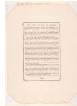
Title: Diagnosis of Pregnancy (Déclaration de la Grossesse) [Text page] from Le monument du costume, 2nd series Date: 1776 Primary Maker: Unidentified artist Medium: etching and engraving