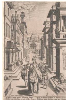
Title: A Lady on Horseback in a street in Florence, from Decorations for the Entry of Joanna of Austria into Florence Date: 1575 Primary Maker: Unidentified artist Medium: engraving