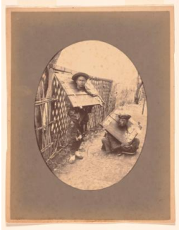
Title: Recto: Two Chinese Prisoners; Verso: Nagasaki Harbor Showing Island of Poffenbury Date: c. 1875 Primary Maker: Unidentified artist Medium: recto: albumen print; verso: albumen print with hand-coloring