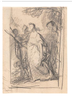
Title: Woman and Attendants Date: n.d.