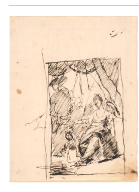
Title: Seated Woman with Child Date: n.d.