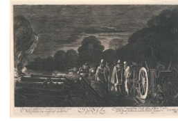
Title: Fire, from The Four Elements