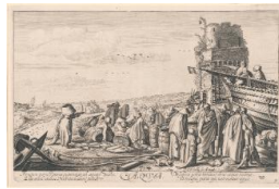
Title: Water, from The Four Elements