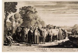
Title: Earth, from The Four Elements