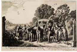
Title: Air, from The Four Elements