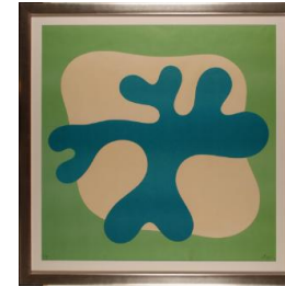
Title: Composition for poster for exhibition at the Basel Kunsthalle Date: 1962 Primary Maker: Hans (Jean) Arp Medium: lithograph on paper