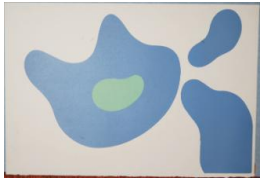
Title: Abstract Date: c. 1952 Primary Maker: Hans (Jean) Arp Medium: Color screenprint on paper