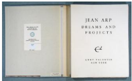
Title: Dreams and Projects [call#: Ne1217/.a76] Date: n.d. Primary Maker: Hans (Jean) Arp Medium: book; text and 28 woodcuts