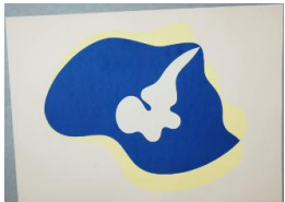
Title: Untitled Date: before 1962 Primary Maker: Hans (Jean) Arp Medium: Color screenprint on paper