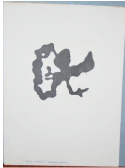
Title: Abstract II Date: mid-twentieth century Primary Maker: Hans (Jean) Arp Medium: Woodcut, black ink on paper