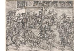
Title: Tournament with Sampson and the Lion Date: 1509 Primary Maker: Lucas Cranach the Elder Medium: woodcut