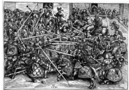
Title: The Tournament with the Lances Date: 1509 Primary Maker: Lucas Cranach the Elder Medium: woodcut