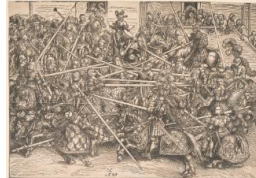
Title: The Tournament of Lavees Date: 1509 Primary Maker: Lucas Cranach the Elder Medium: Woodcut