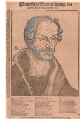
Title: Philip Melanchthon, Bust to the Right Date: early 16th century? Primary Maker: Lucas Cranach the Elder Medium: woodcut