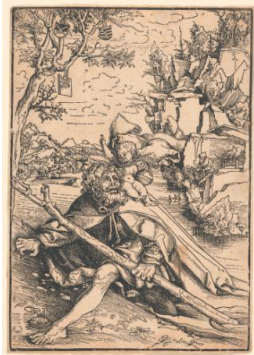
Title: Saint Christopher Date: 1509 Primary Maker: Lucas Cranach the Elder Medium: Woodcut