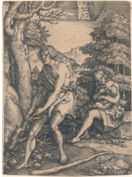
Title: Adam and Eve at Work, from The Story of Adam and Eve Date: 1540 Primary Maker: Heinrich Aldegrever Medium: engraving