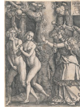
Title: The Expulsion from Paradise, from The Story of Adam and Eve Date: 1540 Primary Maker: Heinrich Aldegrever Medium: engraving