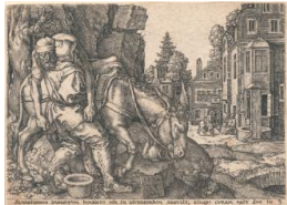
Title: The Good Samaritan Loading Him on His Donkey Date: 1554 Primary Maker: Heinrich Aldegrever Medium: Engraving