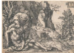
Title: The Good Samaritan Treating His Wounds with Oil and Wine Date: 1554 Primary Maker: Heinrich Aldegrever Medium: Engraving