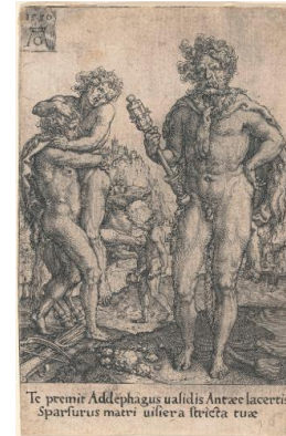
Title: Hercules and Antaeus Date: 1550 Primary Maker: Heinrich Aldegrever Medium: Engraving