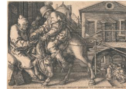
Title: The Good Samaritan Delivering Him at the Inn Date: 1554 Primary Maker: Heinrich Aldegrever Medium: Engraving