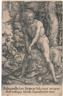
Title: The Fight with the Lion of Nemea Date: 1550 Primary Maker: Heinrich Aldegrever Medium: Engraving