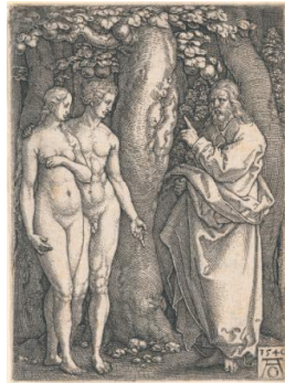
Title: God Forbids Adam and Eve to Eat from the Tree, from The Story of Adam and Eve Date: 1540 Primary Maker: Heinrich Aldegrever Medium: engraving