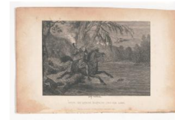
Title: Herne the Hunter Plunging into the Lake, illustration for Windsor Castle by William Harrison Ainsworth Date: 1842 Primary Maker: George Cruikshank Medium: etching