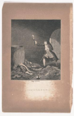
Title: Abel Beechcroft Discovering the Body of the Miser in the Cellar, illustration for The Miser's Daughter by William Harrison Ainsworth Date: 1842 Primary Maker: George Cruikshank Medium: etching