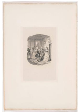
Title: The Duchess Foiled by Harley in her Attempt to Interrupt the Marriage between Masham and Abigail, illustration for Saint James's, or, the Court of Queen Anne by William Harrison Ainsworth Date: 1844 Primary Maker: George Cruikshank Medium: etching