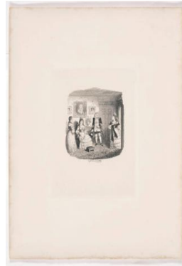
Title: Harley's Secret Interview with the Queen Interrupted by the Duchess of Marlborough, illustration for Saint James's, or, the Court of Queen Anne by William Harrison Ainsworth Date: 1844 Primary Maker: George Cruikshank Medium: etching