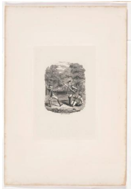
Title: The Double Duel, illustration for Saint James's, or, the Court of Queen Anne by William Harrison Ainsworth Date: 1844 Primary Maker: George Cruikshank Medium: etching