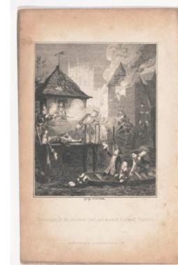
Title: Dispersion of the Jacobite Club and the Death of Cordwell Firebras, illustration for The Miser's Daughter by William Harrison Ainsworth Date: 1842 Primary Maker: George Cruikshank Medium: etching