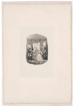
Title: Marlborough and Godolphin Demanding Harley's Dismissal of the Queen, illustration for Saint James's, or, the Court of Queen Anne by William Harrison Ainsworth Date: 1844 Primary Maker: George Cruikshank Medium: etching