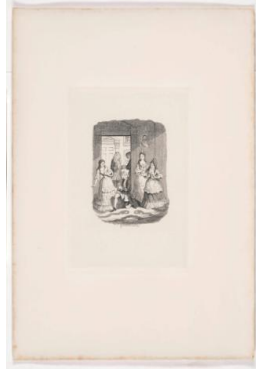
Title: Can This Be Mr. Masham?, illustration for Saint James's, or, the Court of Queen Anne by William Harrison Ainsworth Date: 1844 Primary Maker: George Cruikshank Medium: etching