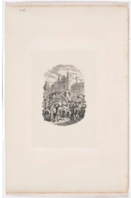
Title: The Duke of Marlborough's Departure for Flanders, illustration for Saint James's, or, the Court of Queen Anne by William Harrison Ainsworth Date: 1844 Primary Maker: George Cruikshank Medium: etching