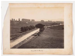
Title: Acquedotti Di Claudio Date: 19th century Primary Maker: Unidentified artist Medium: albumen print