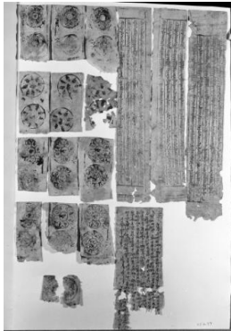
Title: 17 Printed Fragments Apparently Once Kept in a Statue of Buddha Date: n.d. Primary Maker: Unidentified artist Medium: ink on rice paper