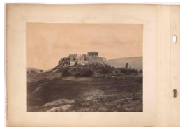
Title: The Acropolis Date: 19th century Primary Maker: Unidentified artist Medium: albumen print