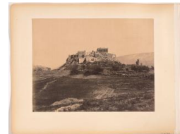
Title: The Acropolis Date: 19th century Primary Maker: Unidentified artist Medium: albumen print