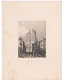
Title: Abbeville Cathedral Date: n.d. Primary Maker: Unidentified artist Medium: engraving and etching