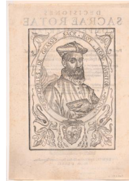
Title: Achilles De Grassis Date: 1590? Primary Maker: Unidentified artist Medium: Woodcut