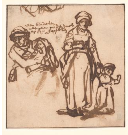
Title: Studies of Women and Children Date: c. 1639-40 Primary Maker: Rembrandt van Rijn Medium: Pen and brown ink with brush or finger smudging on paper; framing lines in brown ink.