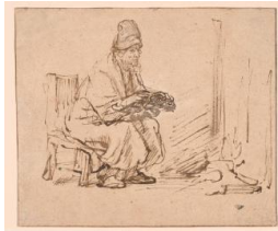
Title: Seated Man Warming His Hands by a Fire Date: c. 1650-52 Primary Maker: Rembrandt van Rijn Medium: Pen and brown ink with corrections in white on paper; framing lines at top, left, and bottom in brown ink, and at right in black ink