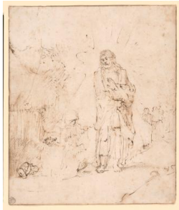
Title: Noli me tangere Date: c. 1650-52 Primary Maker: Rembrandt van Rijn Medium: Pen and brown ink with a few additions in wash and touches of white on paper; framing lines in brown ink.