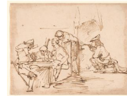
Title: Studies of a smoker and group of card players Date: c. 1635-40 Primary Maker: Rembrandt van Rijn Medium: Pen and brown ink on paper