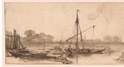
Title: Landscape with Canal and Boats Date: c. 1652-55 Primary Maker: Rembrandt van Rijn Medium: Pen in brown ink with brown wash on paper, framing lines in brown ink