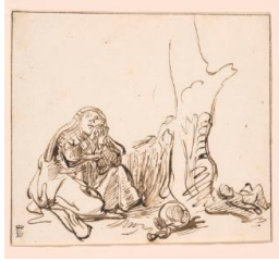
Title: Hagar and Ishmael, copy after Rembrandt's Hagar and Ishmael in the Wilderness Date: 1630s Primary Maker: Rembrandt van Rijn Medium: pen and brown ink over graphite