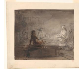
Title: The supper at Emmaus Date: c. 1650-52 Primary Maker: Constantijn van Renesse Medium: Pen and black ink, brown and gray wash, over black and red chalk on paper