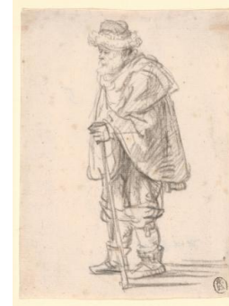
Title: Man with a Walking Stick Wearing a Fur Cap Date: c. 1647-48 Primary Maker: Rembrandt van Rijn Medium: Black chalk on paper