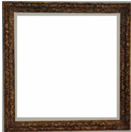
Title: Frame (now housing 77.55.1) Date: c.1710 Primary Maker: Unidentified artist Medium: wood and gold leaf