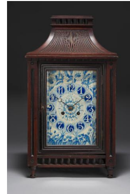
Title: Clock Date: c. 1875-1880 Primary Maker: Lewis Foreman Day Medium: porcelain face and side panels in ebonized birchwood case