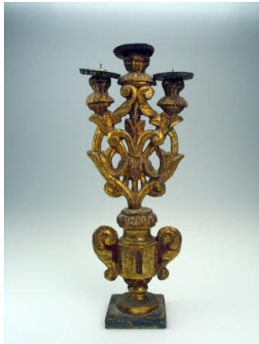
Title: Candlestick Date: n.d. Primary Maker: Unidentified artist Medium: Gilded wood