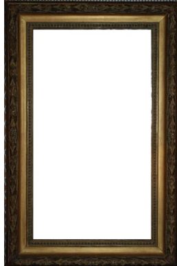
Title: Cove Frame with Oak Leaf Top Purchased for the Bouguereau painting 77.3.1 Date: late 18th century Primary Maker: Unidentified artist Medium: wood and gold leaf