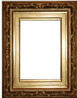
Title: Frame, Purchased for 84.22.1 Date: late 19th century Primary Maker: Unidentified artist Medium: wood, gesso, and gold leaf