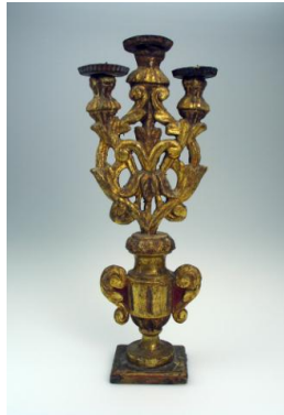
Title: Candlestick Date: n.d. Primary Maker: Unidentified artist Medium: Gilded wood