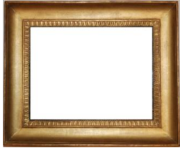
Title: Cove Frame Purchased for the Camuccini painting 62.10.1 Date: 19th century Primary Maker: Unidentified artist Medium: wood and gold leaf