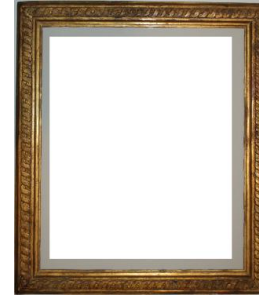
Title: Frame, Currently holding 81.13.1 Date: 18th century Primary Maker: Unidentified artist Medium: wood with gold leaf