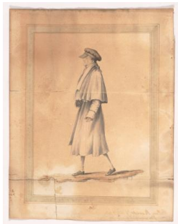
Title: John Randolph of Roanoke Date: early 19th century Primary Maker: Unidentified artist Medium: Watercolor