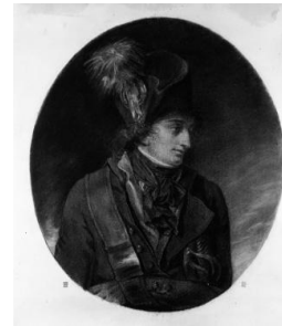
Title: A Napoleonic Officer (Possibly Marshall Jean Baptiste Bernadotte) Date: c. 1795 Primary Maker: Jean-Baptiste Isabey Medium: black and white chalk