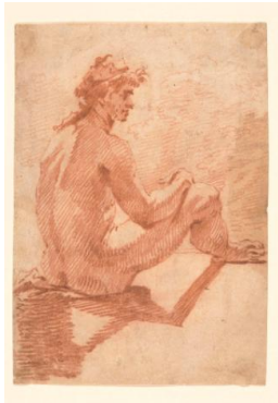
Title: Figure of a Man from the Back Date: n.d. Primary Maker: Unidentified artist Medium: red chalk