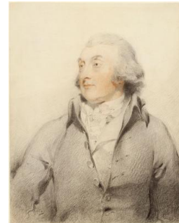
Title: Portrait of a Gentleman Date: 1795 Primary Maker: Thomas Lawrence Medium: black and red chalk