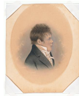
Title: Gentlemen's Profile Date: late 18th-19th century Primary Maker: Unidentified artist Medium: Watercolor and gouache