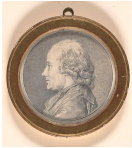
Title: The abbé de Véry Date: 1761 Primary Maker: Charles-Nicolas Cochin the Younger Medium: graphite