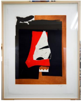
Title: Alphabet Series (O)