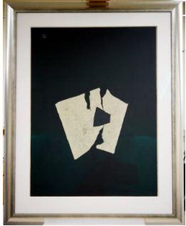
Title: Night Music Opus No. 5