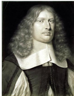
Title: Hermann Egon von Fürstenberg, Chamberlain and Privy Councilor to the Elector of Bavaria Date: 1658 Primary Maker: Wallerant Vaillant Medium: black and white chalk and graphite on blue paper