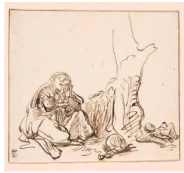
Title: Hagar and Ishmael, copy after Rembrandt's Hagar and Ishmael in the Wilderness Date: 1630s Primary Maker: Rembrandt van Rijn Medium: pen and brown ink over graphite