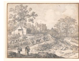
Title: October: The Grape Harvest Date: n.d. Primary Maker: Allaert van Everdingen Medium: black and gray washes