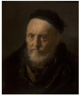
Title: A Bearded Old Man Wearing a Beret Date: 1631 Primary Maker: Jan Lievens Medium: oil on panel