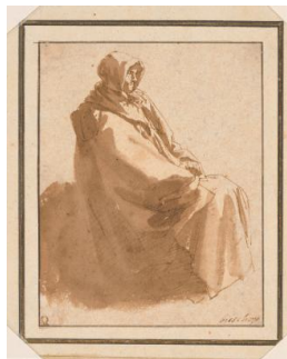
Title: Study of a Seated Woman Date: c. 1665-70 Medium: Pen and brush in brown ink on paper; framing lines in black over brown ink