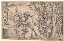
Title: Hercules Strangling the Nemean Lion Date: 1548 Primary Maker: Hans Sebald Beham Medium: Engraving on paper