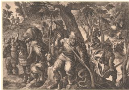
Title: Boar Hunt with Shotguns, from Venationes Ferarum, Avium, Piscium Date: c. 1578 Primary Maker: Philip Galle Medium: engraving