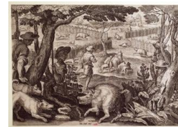
Title: Boar Drive toward a Pit, from Venationes Ferarum, Avium, Piscium Date: c. 1578 Primary Maker: Philip Galle Medium: Engraving on paper