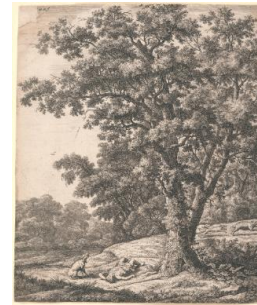
Title: The Death of Adonis Date: n.d. Primary Maker: Anthonie Waterloo Medium: etching