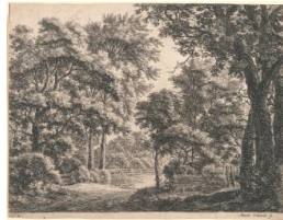
Title: The Trimmed Groves Date: n.d. Primary Maker: Anthonie Waterloo Medium: etching