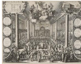
Title: The Dedication of the Portuguese Synagogue in Amsterdam Date: 1675 Primary Maker: Romeyn de Hooghe Medium: etching