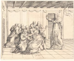
Title: Christ Appearing to the Apostles Date: 1547 Primary Maker: August Hirschvogel Medium: etching