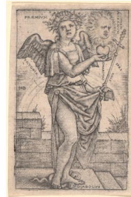
Title: Allegory of Christianity Date: 1548 Primary Maker: Hans Sebald Beham Medium: Engraving on paper