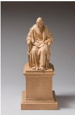
Title: Voltaire Date: dated 1778, probably made between 1779 and 1793 Primary Maker: Jean-Antoine Houdon Medium: painted plaster and wood