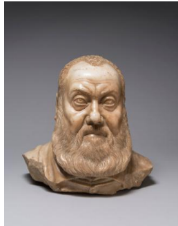
Title: Head of a Bearded Man Date: 1567-1570 Primary Maker: Giovanni Antonio Dosio Medium: marble