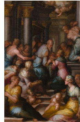
Title: The Presentation in the Temple Date: 1577 Primary Maker: Giovanni Battista Naldini Medium: oil on wood panel