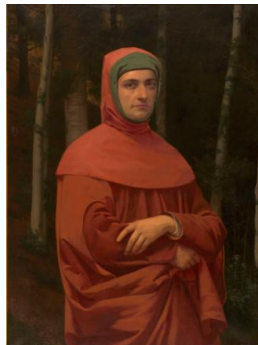
Title: Man in a Wood Date: c. 1846 Primary Maker: Unidentified artist Medium: oil on canvas