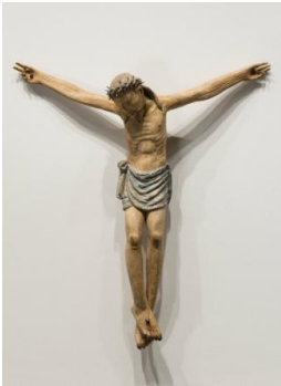
Title: Crucifix Corpus Date: 15th or 16th century? Primary Maker: Unidentified artist Medium: painted wood