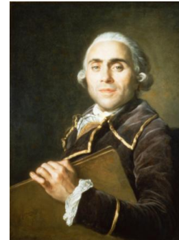
Title: Portrait of an Artist Date: 1787 Primary Maker: Joseph-Siffred Duplessis Medium: oil on canvas