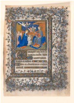
Title: Coronation of the Virgin (Illustration for the Penitential Psalms) Date: 1408 Medium: Leaf from a manuscript; ink, tempera, and brushed gold on vellum