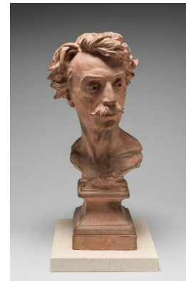
Title: Jean- Léon Gérôme (1824-1904) Date: modelled in 1871, cast in 1873 Primary Maker: Jean-Baptiste Carpeaux Medium: terracotta