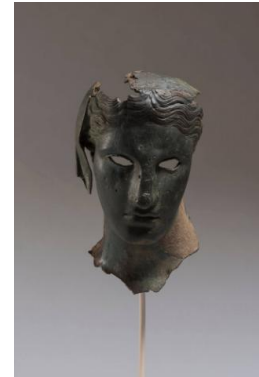
Title: Bronze Head of a Woman Date: 2nd century BCE Primary Maker: Unidentified artist Medium: bronze