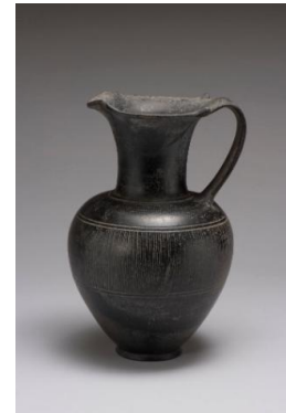
Title: Pitcher Date: 625-600 BCE Primary Maker: Unidentified artist Medium: earthenware