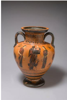
Title: Neck-Amphora, with Apollo, Leto, and Artemis, Departure Scene Date: c. 540-530 BCE Primary Maker: Bucci Painter Medium: terra cotta, black-figure ware