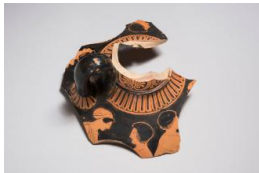
Title: Fragment of Neck-Amphora with Youths, Girls Date: c. 400 BCE Primary Maker: Palermo Painter Medium: terracotta