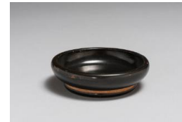
Title: Stemless Dish Date: c. 450-425 BCE Primary Maker: Unidentified artist Medium: earthenware