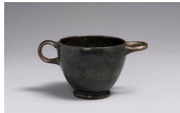
Title: Skyphos, Cup, with Disparate Handles Date: c. 480-450 BCE Primary Maker: Unidentified artist Medium: earthenware