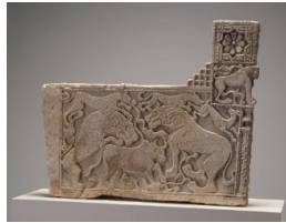
Title: Balustrade with Arabesque and Animal Decorations Date: c.1100 - 1350 Primary Maker: Unidentified artist Medium: Sandstone