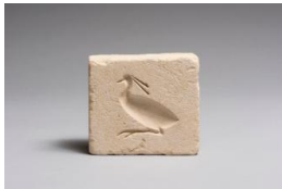
Title: Mold for a Bird Amulet Date: 959-909 BCE Primary Maker: Unidentified artist Medium: limestone