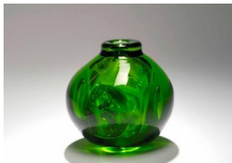
Title: Untitled ('Aerial Sculpture') Date: 1969 Primary Maker: Dominick Labino Medium: glass