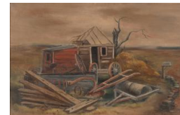
Title: Farm Yard Date: n.d. Primary Maker: Arnold Blanch Medium: oil on canvas