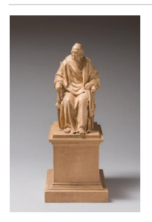
Title: Voltaire Date: dated 1778, probably made between 1779 and 1793 Primary Maker: Jean-Antoine Houdon