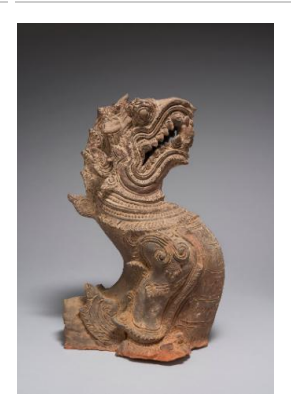
Title: Roof Decoration: a Sea Monster (Makara) Date: 15th century Primary Maker: Unidentified artist Medium: terracotta