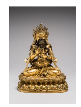
Title: White Chakrasamvara and Vajravarahi Date: 15th century Primary Maker: Unidentified artist Medium: gilt bronze