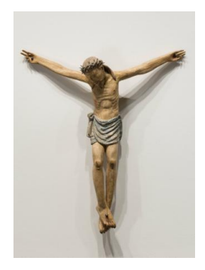
Title: Crucifix Corpus Date: 15th or 16th century? Primary Maker: Unidentified artist Medium: painted wood