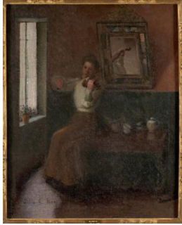
Title: The Violinist Date: c. 1895 Primary Maker: Lilla Cabot Perry Medium: Oil on canvas