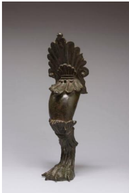
Title: Lion-Footed Cauldron Leg Date: 1 - 100 CE Primary Maker: Unidentified artist Medium: bronze