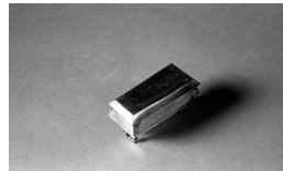
Title: Reliquary with Lid Date: n.d. Primary Maker: Unidentified artist Medium: silver