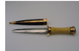
Title: Dagger and Scabbard Date: n.d. Primary Maker: Unidentified artist Medium: yellow ivory? gold? stainless steel, gem