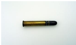
Title: Bullet Case Date: n.d. Primary Maker: Unidentified artist Medium: brass and lead?