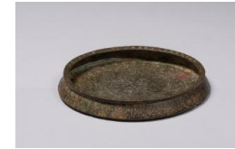
Title: Shallow Dish Date: n.d. Primary Maker: Unidentified artist Medium: bronze