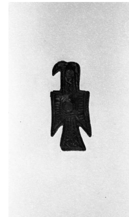
Title: Eagle Fibula Date: n.d. Primary Maker: Unidentified artist Medium: bronze