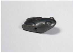
Title: Frog Date: c. 2800-2000 BCE Primary Maker: Unidentified artist Medium: hematite