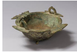
Title: Cauldron Date: 10th century Primary Maker: Unidentified artist Medium: bronze